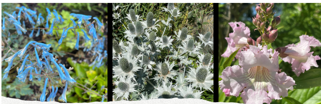
Corydalis 'Porcelain Blue', Eryngium variifolium , Chitalpa tashkentensis (l-r)

Moving on now to some C's, the Centaurea macrocephala (Yellow knapweed) in the Drought Tolerant Garden are looking magnificent, their bulbous flowerheads glowing brightly yellow; the finely cut foliage of nearby Coreopsis is topped by equally bright yellow daisies.