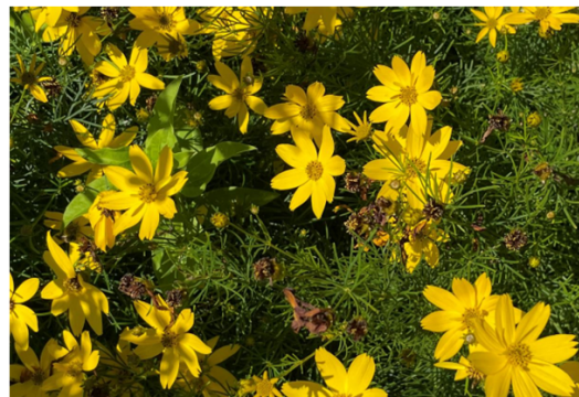
Centaurea macrocephala (Yellow knapweed), Coreopsis (l-r)

Moving on now to some C's, the Centaurea macrocephala (Yellow knapweed) in the Drought Tolerant Garden are looking magnificent, their bulbous flowerheads glowing brightly yellow; the finely cut foliage of nearby Coreopsis is topped by equally bright yellow daisies.