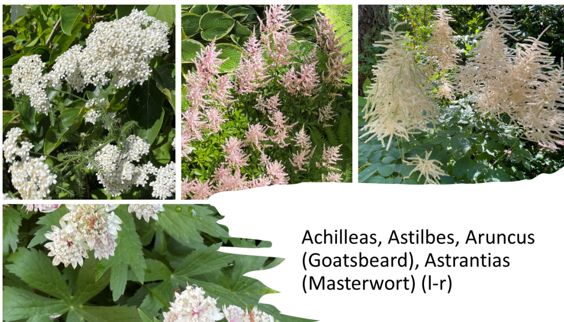
Achilleas, Astilbes, Aruncus (Goatsbeard), Astantias (Masterwort) (l-r)

Walking in the Gardens there is so much colour to enjoy. The Lily Garden is especially spectacular and the Cutting Garden is bursting with blooms. Unable to mention everything in a single column, I must choose some filter so this month I shall take an alphabetical approach, and start with some A's.