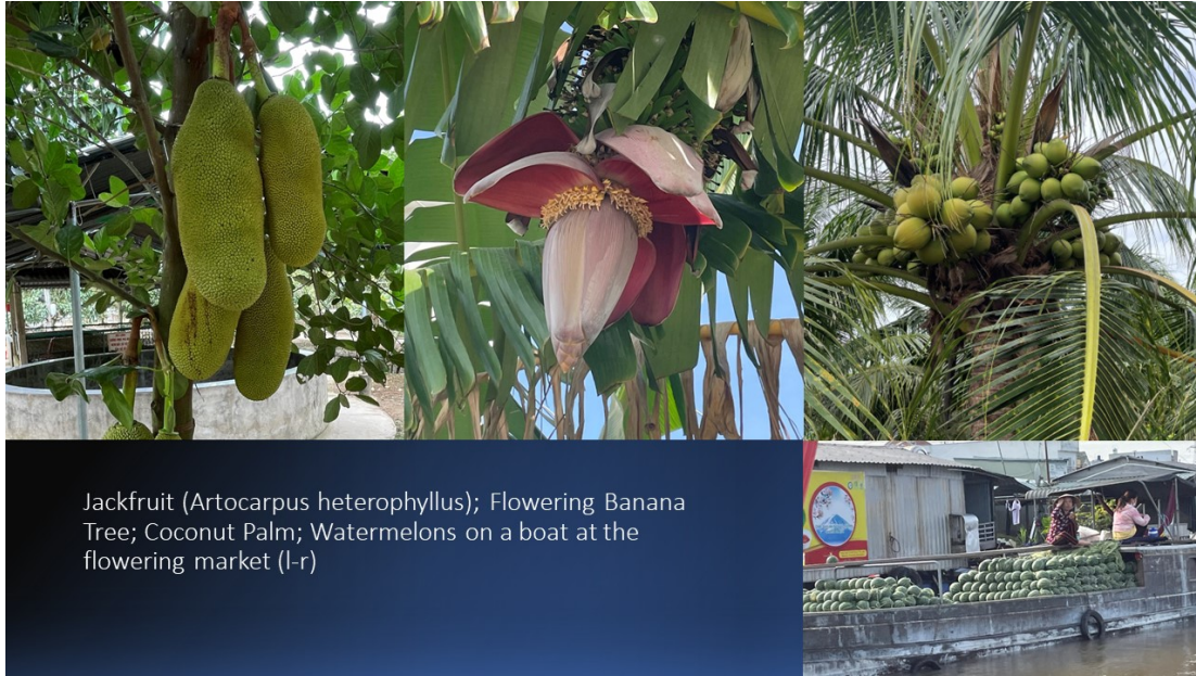
Jackfruit ( Artocarpus heterophyllus ); Flowering Banana Tree; Coconut Palm; Watermelons on a boat at the floating market (l-r)

plantations and with an average yield of around seven tons per hectare it is one of the most important producers of rice in the world.