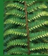
Polystichum polyblepharum JAPANESE TASSEL FERN