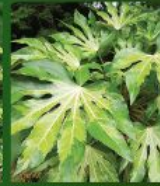
Fatsia japonica 'Murakumo nishiki' CAMOUFLAGE™ CAMOUFLAGE JAPANESE FATZIA