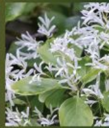
Chionanthus retusus CHINESE FRINGE TREE