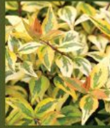
Abelia x grandiflora 'Kaleidoscope' KALEIDOSCOPE VARIEGATED ABELIA