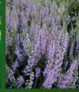
Calluna vulgaris 'Spring Torch' SPRING TORCH HEATHER