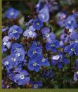
Veronica peduncularis 'Georgia Blue' GEORGIA BLUE SPEEDWELL