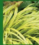
Hakonechloa macrochaeta 'Aureola' VARIEGATED JAPANESE FOREST GRASS