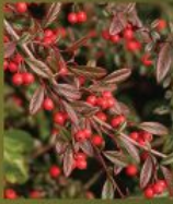
Cotoneaster salicifolius 'Repens' SPREADING WILLOWLEAF COTONEASTER