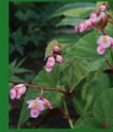
Begonia grandis ssp. evansiana HARDY BEGONIA