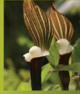
Arisaema sikokianum JAPANESE COBRA LILY