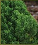
Veronica cypripedifolia Boughton Dome BOUGHTON DOME HEBE