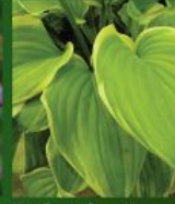
Hosta 'Fragrant Bouquet' FRAGRANT BOUQUET HOSTA