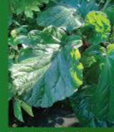
Bergenia ciliolata 'Dumbo' DUMBO BERGENIA