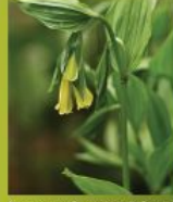
Disporum uniflorum (syn. D. flavescens ) FAIRY BELLS