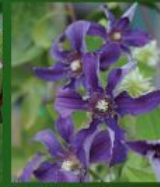
Clematis 'Clemisnow 51' SAPHYRA INDIGO™ SAPPHIRE INDIGO CLEMATIS