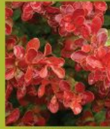
Berberis thunbergii 'Goruzumi' GOLDEN RUBY GOLDEN RUBY JAPANESE BARBERRY