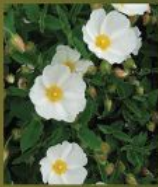
Cistus x hybridus WHITE ROCKROSE