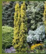
Taxus baccata 'Standishi' STANDISHII GOLDEN YEW