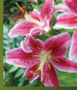
Lilium 'Star Gazer' STAR GAZER ORIENTPET LILY