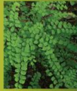
Adiantum x inaequalis TRACY'S MAIDENHAIR FERN