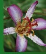
Tricyrtis 'Taipei Silk' TAIPEI SILK TOAD LILY