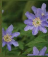
Anemone nemorosa WOOD ANEMONE