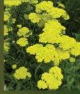
Achillea 'Moonshine' MOONSHINE YARROW