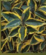
Elaeagnus x ebbingei 'Gilt Edge' GILT EDGE VARIEGATED ELAEAGNUS