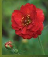
Geum 'Double Bloody Mary' DOUBLE BLOODY MARY GEUM