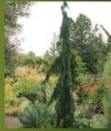
Cupressus nootkatensis Green Arrow GREEN ARROW WEEPING ALASKAN YELLOW CEDAR