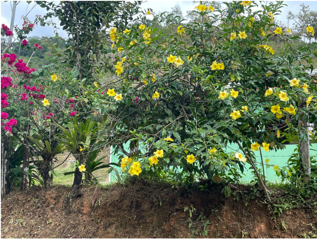
Allamanda and bougainvillea

Clockwise Bottom: Another unusual orchid; Ripe chocolate pod; A tiny orchid; Laziness Tree; A weird orchid and its natural pollinator