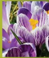
Crocus 'Pickwick' PICKWICK CROCUS