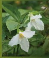
Trillium grandiflorum GREAT WHITE TRILLIUM, WHITE WAKE-ROBIN