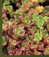
Sedum oregonum OREGON STONECROP