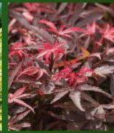
Acer palmatum 'Shaina' SHAINA DWARF RED JAPANESE MAPLE